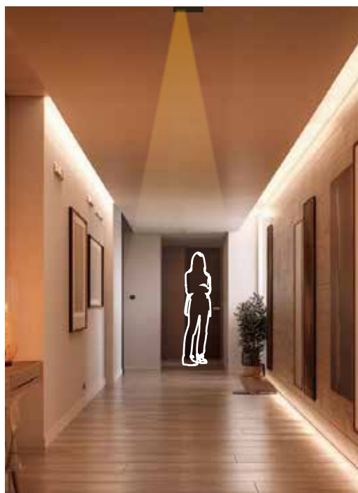
Light up the path during the night