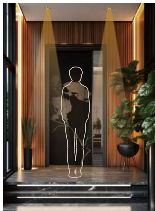
Warm welcome from your home